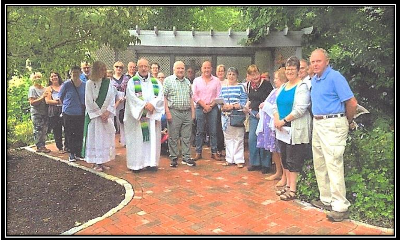
Dedication of the New Pathway in the Memorial Garden in August 2024